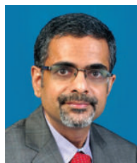
T. N. Krishnan