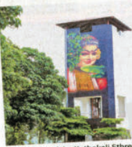
A depiction of the Kathakali Sthre a water tank on the IIM-K campus.

The mural painting of a Shreevesham, the feminine role in Kathakali, peering out from foliage, has become one of the latest attractions on the Indian Institute of Management Kozhikode (IIM-K) campus at Kunnammangalam.